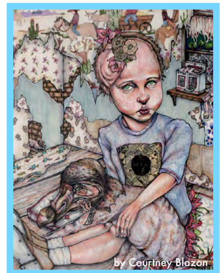
by Courtney Blazon