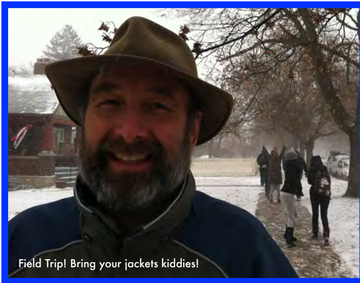
Field Trip! Bring your jackets kiddies!